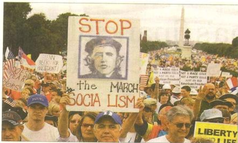
Demonstrators protest on Capitol Hill on Saturday against President Barack Obama. Protesters expressed anger at health care legislation and support for low taxes and smaller government.